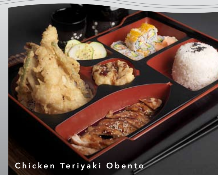
Chicken Teriyaki Obento