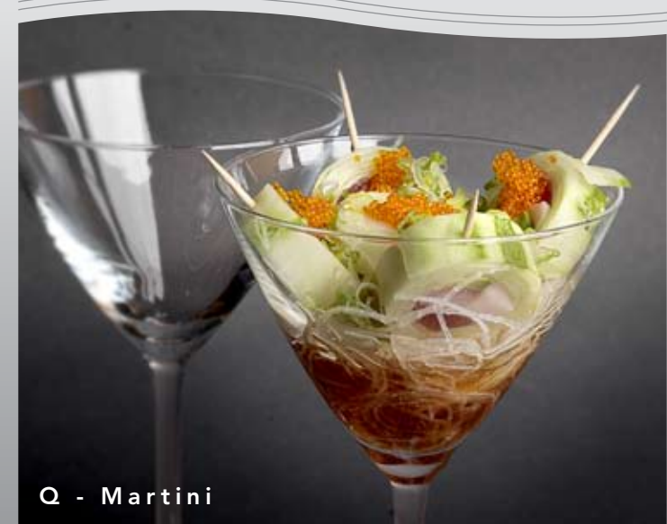
Q - Martini