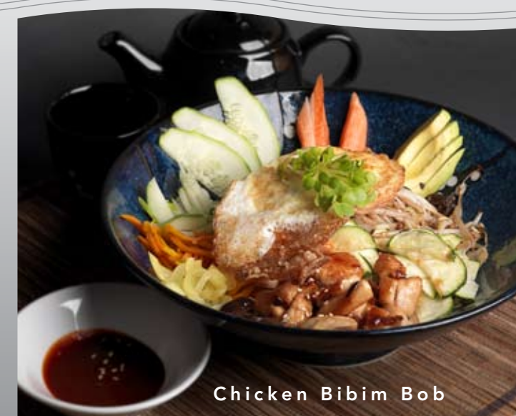
Chicken Bibim Bob